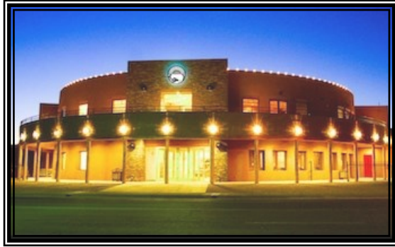
Indian Pueblo Cultural Center, Albuquerque

Here you will enter a mysterious Victorian house that has dissolved the nature of time and space creating a multiverse of uniquely different realities. Explore your own magical thinking as you stroll, climb or crawl through 22,000 square feet of mind-stimulating, conceptual art environments.