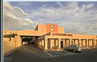
Best Western Rio Grande Inn

By popular demand we have again chosen the Best Western Rio Grande Inn to host our 2017 Conference. Located in Albuquerque's historic Old Town district, the Inn is walking distance to numerous unique shops, restaurants, galleries, and museums. This classic Southwestern inn is known for its warm hospitality, excellent regional cuisine, and refreshing beverages. A complimentary shuttle is available to transport you to and from the Albuquerque Sunport, Old Town Plaza, the Indian Pueblo Cultural Center, and the Albuquerque Biopark and numerous museums.