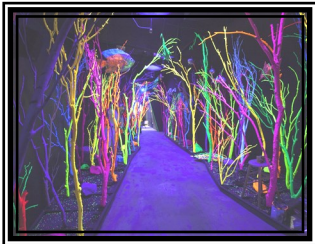
The House of Eternal Return

Meow Wolf's House of Eternal Return is a magical art experience: part jungle gym, part adult fun-