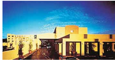
The Best Western Rio Grande Inn, 1015 Rio Grande Blvd., NW, Albuquerque, NM, 87104-2031, Phone 505 843 9500

The conference theme "A Magical Mystery Tour" will take the participant on a mystical journey through the Brotherhood of Light teachings on astrology, alchemy, and the tarot.