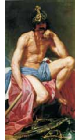
Mars - Diego Velasquez 1639-41

To the ancient Greeks, Ares was Mars the God of War which rules the sign of Aries and Scorpio. Mars has two small and irregularly shaped moons, fittingly named after two of the sons of Ares, Phobos (fear) and Deimos (dread). Ares represented the unpredictable violence of war which could express as bloodlust and savage warfare. Ares’ quadriga