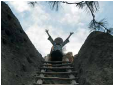
Summoning the Spirits Roe Libretto

The magic begins on Wednesday with a tour of Bandelier National Monument and a stop at Valles Caldera en route.