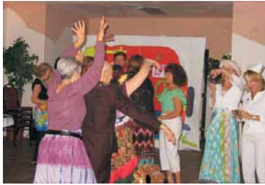
Too much fun...