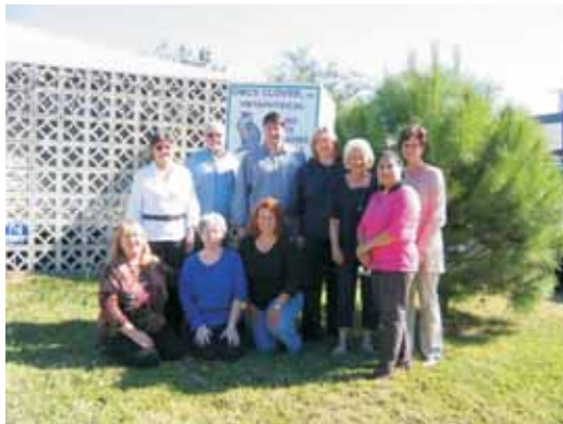
2009 Schedule of Classes

Trinity of Psychism Tuesday, September 1st - 7-9:00 p.m.