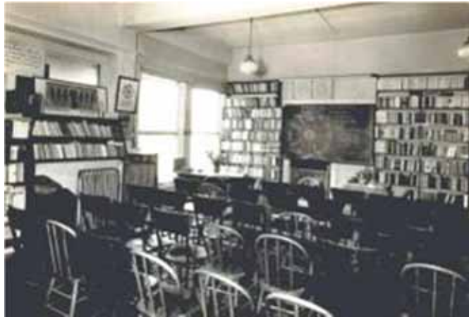
Classroom Los Angeles, Early 20th Century