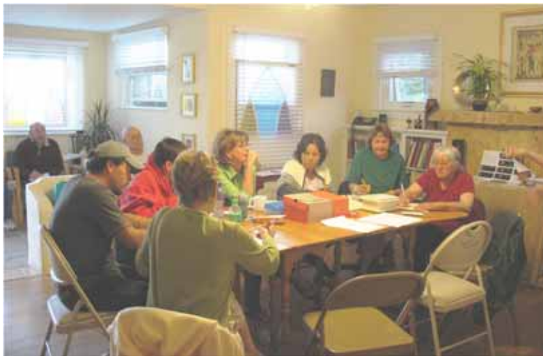
Albuquerque Classroom, 2009