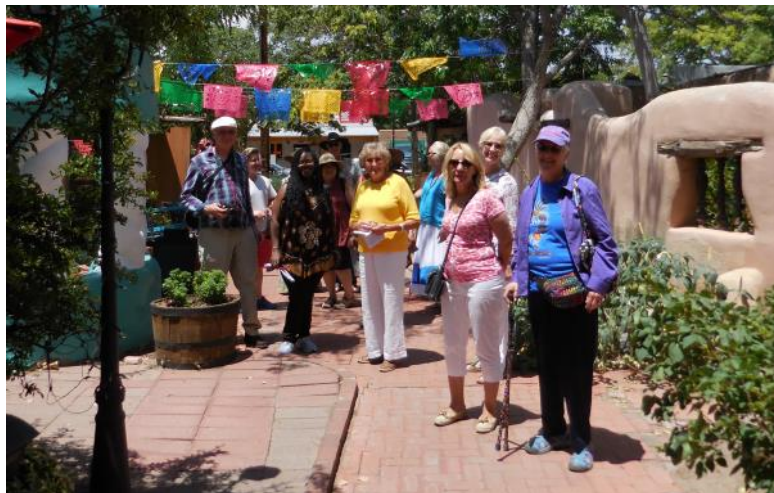
Convention 2015—Tour of Old Town Albuquerque